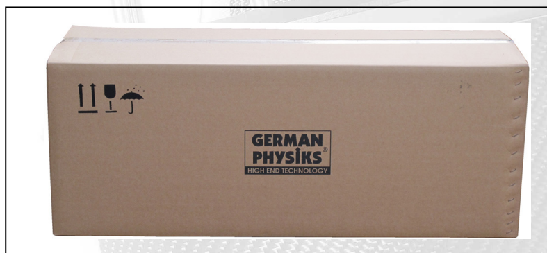
Figure 1. Carbon Mk IV shipping carton