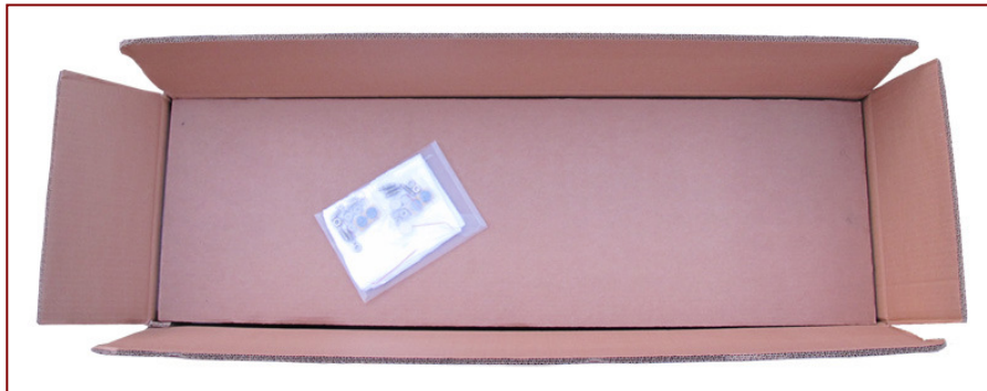
Figure 2. Borderland Mk IV accessories