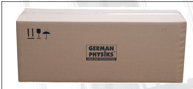
Figure 1. Borderland Mk IV shipping carton