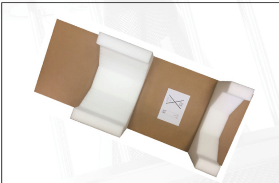
Figure 3. Borderland Mk IV shipping carton top packing piece

3. Remove the top packing piece shown in figure 3.