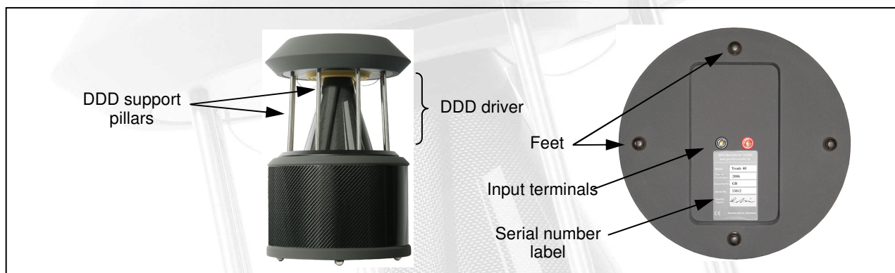
Figure 3. Principle Features of the Troubadour 40