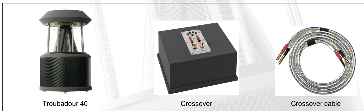
Figure 1. Troubadour 40 Major Components

If any items are missing, or if any item shows signs of damage, please contact the supplying audio dealer immediately.