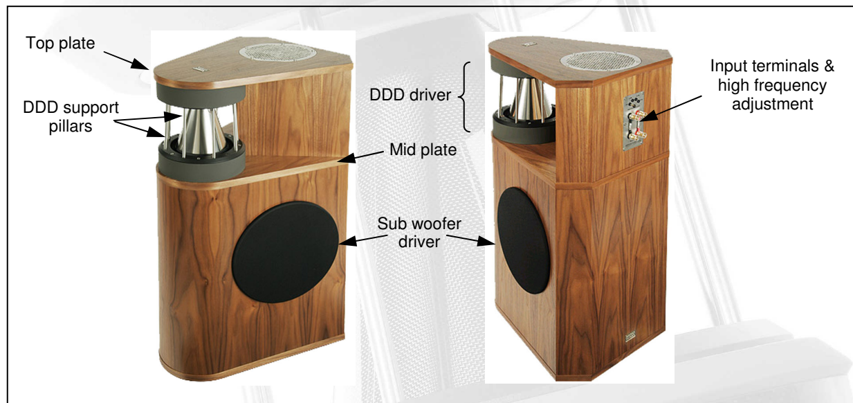
Figure 2. Principle Features of the PQS-202 Mk II