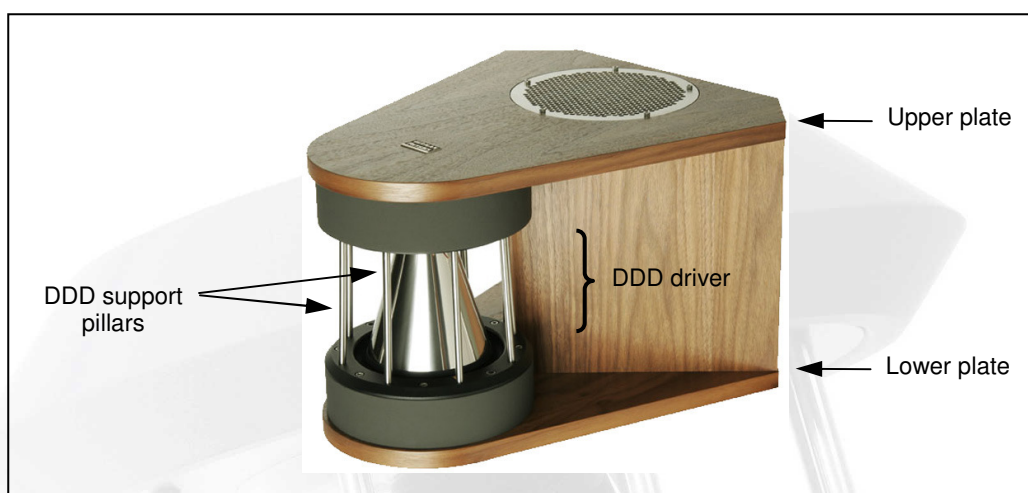
Figure 2. The Principle Features of the PQS-201 Mk II